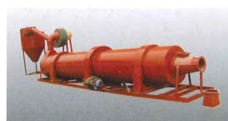
滚筒式烘干机 Drum-type drier

Machineries and export market available.