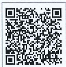
Annual Report 2022

Please scan the below QR codes to download the Annual Report 2022.